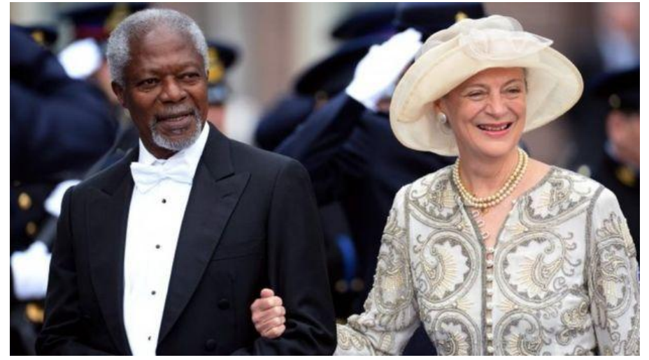
and his Foundation announced the death of the great man and added: "the world lost a man of deep conviction who was as committed to instilling the values of fairness, integrity, kindness, and service in each of us, as he was to