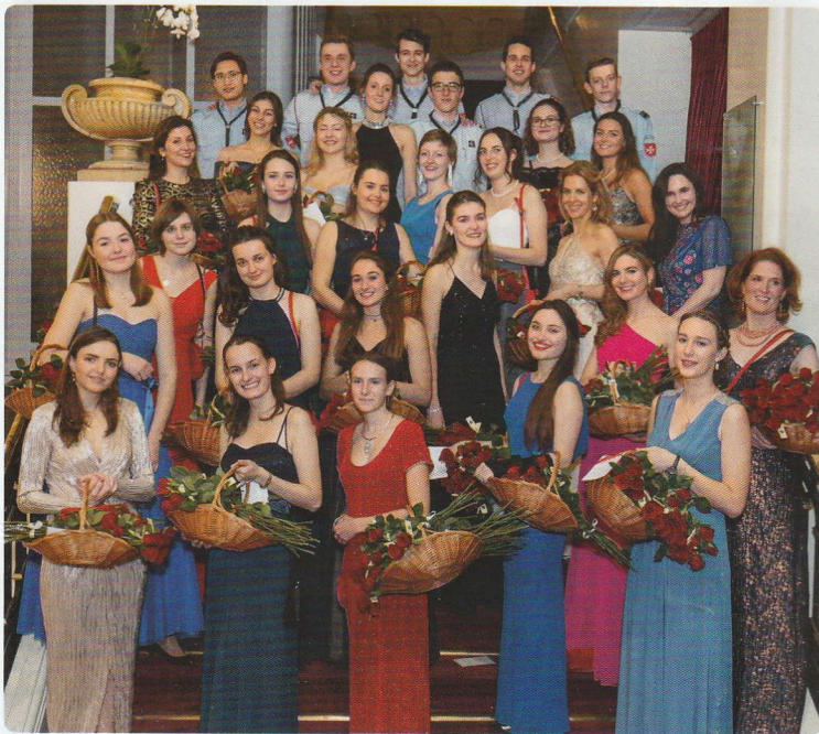
Devoted team of young girls and boys