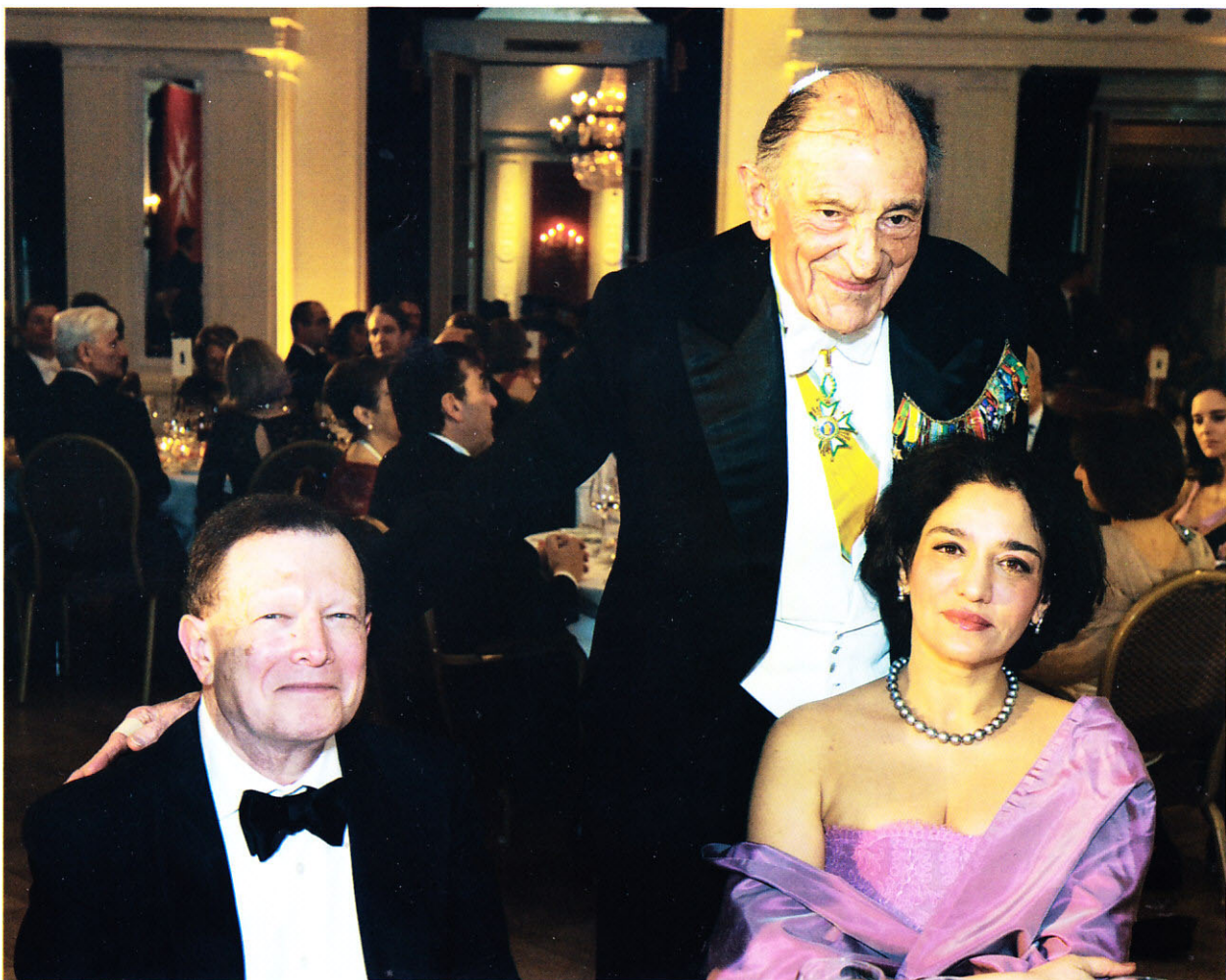
From left to right: