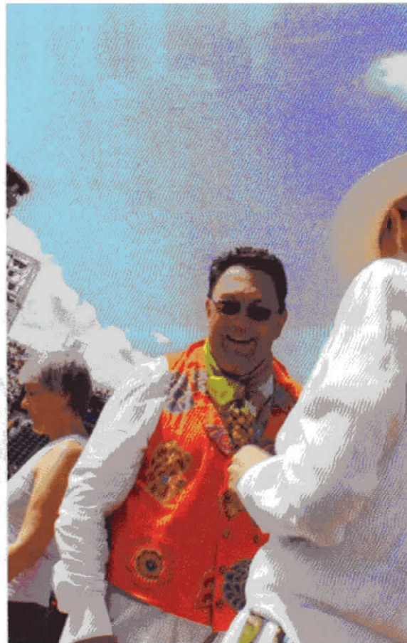
Hon. Mr. Laurent Wehrli, Mayor of Montreux at the show.