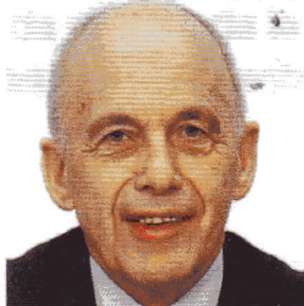
President Ueli Maurer