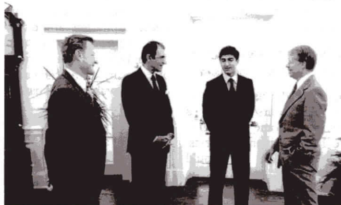
Bellow:From left: Brzezinski,H.E.Zahedi, Prince Reza,President Carter, at the White-House

AZ: Thank you, and I am very glad to talk to you.