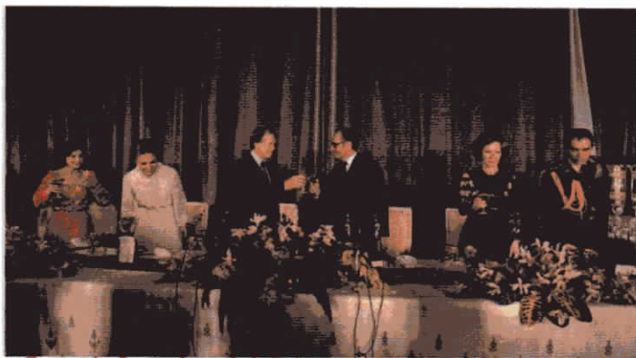
Carter in Iran, from left:Princes Ashraf,Shabanoo,pres. Carter,The Shah, 1st lady Carter,Prince Gholamreza

peace and sincerity is in the store. One day this same Americans will need us. And we also need them. The world has become a global village. The seven billion people of the world today depend on each other and are obliged to live together in peace. Look at the Chinese, they have become closest friends of Iran. Politician may be full of tricks and deceptions but people remain honest and sincere, devoted to their human causes. I believe in this though I do not insist for I may be wrong.