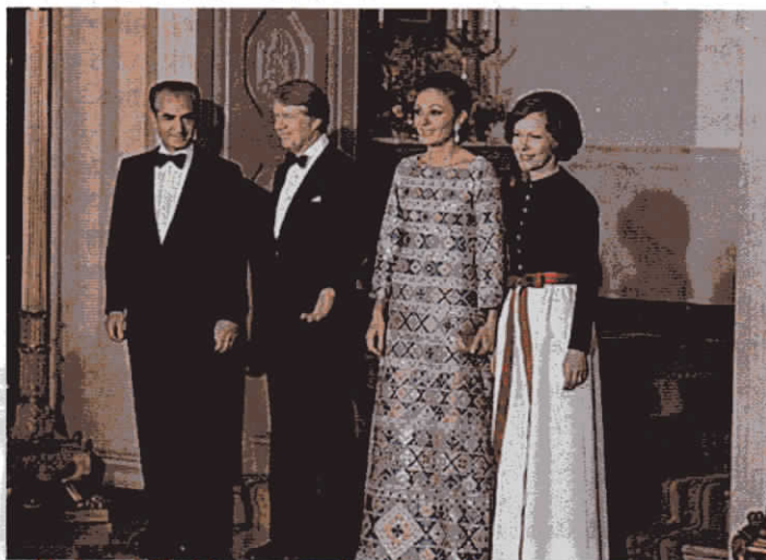
Shah and Shahbanoo at the White House

was surrounded by a bunch of flatterers and liars and we saw the outcome. It was the Shah himself who told the Iranian Ambassador to go and speak to Khomeini.