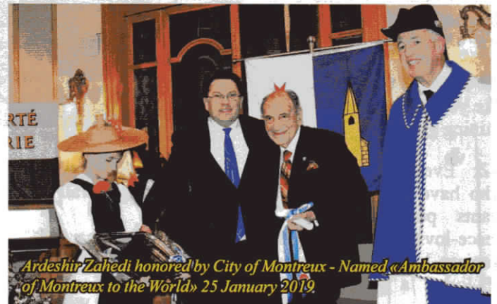
Ardeshir Zahedi honored by City of Montreux - Named «Ambassador of Montreux to the World» 25 January 2019.

expand its territory and America is behind it, supporting all its moves. We had brotherly relations with Syria. When we were at war with Saddam and he had invaded our country, Syrians came to help us. We owe them part of our victory.